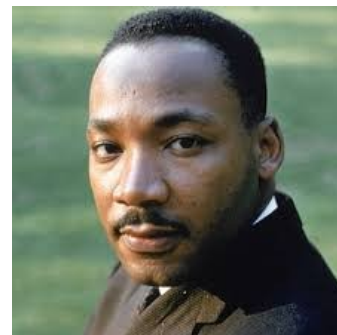
Rev. Dr. Martin Luther King, Jr.

You have the power, in both of these visions, the spiritual and the spirit-in-nature, to begin the change you want to see. And you have the power to stand against the entire world in those times when the world sinks into the confusion of greed and violence. In terms of a mutual support network, Gandhi's vision allows us to see one another as partners in the mobilization of that profound compassionate intelligence, hidden, but yearning to be born, in every human being. ( Mahatma Gandhi Study Resources )