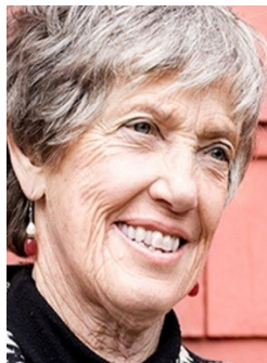
Joanna Macy, founding teacher of The Work That Reconnects

To the contrary, Joanna Macy declares, with the deep strength of a grandmother determined to protect her family and the Family of Life as well, our pain for the world bears witness to our love for the world. Our pain for the world is not a failure, it is the best part of us yearning to be expressed. Even more, our pain for the Web of Life and the obliteration of countless species, is the Web of Life itself speaking through us , moving through us, and calling us to a life of heroic service.